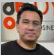
Jeirus 5 Kg