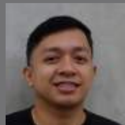
Lem 82 pts