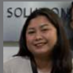
Mye 118 pts