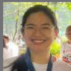
Trisha 63 pts