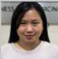
Chai 4.7 Kg