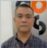
Flo 10.6 Kg