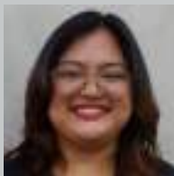
Raz 9 Kg