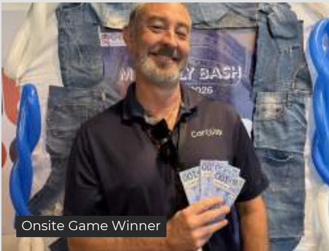
Onsite Game Winner