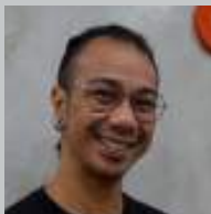
Roland 5 Kg