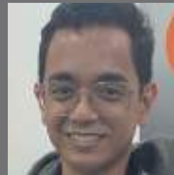
Poch 124 pts