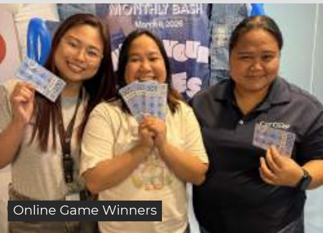
Online Game Winners