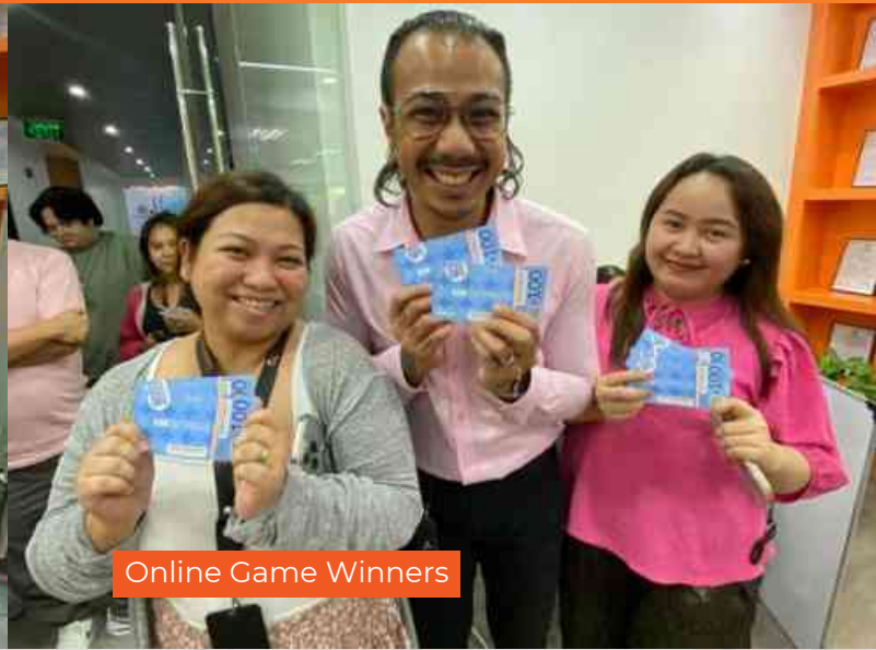
Online Game Winners

This October, we joined the Cancer Awareness movement and made it a month about showing support and standing together for a meaningful cause. Everyone dressed in pink—to show solidarity and raise awareness in style. Add some good food, plenty of laughs, and everyone dressed in pink to show support, it all made for a much-needed break from our everyday tasks.