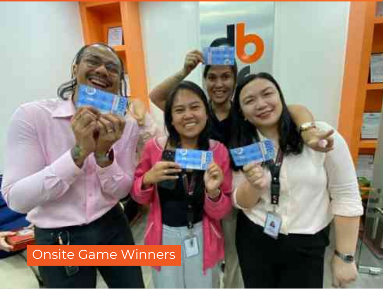
Onsite Game Winners