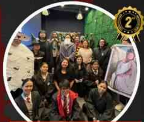
Unit 501: Harry Potter