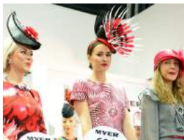
2022 Melbourne Cup 1 November 2022