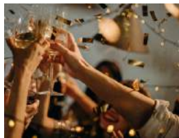
DBOS Year-End Party 17 December 2022